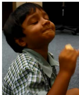
Smell the orange.