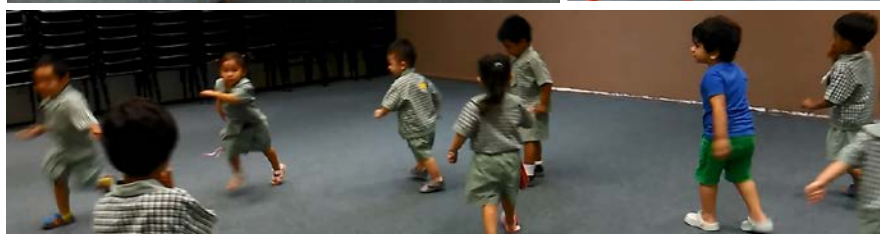
Motor Skill Development - Walking, jumping and running.