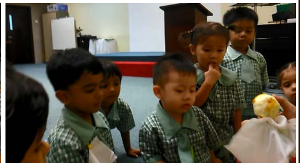
Look at the orange. Can't wait to taste it...