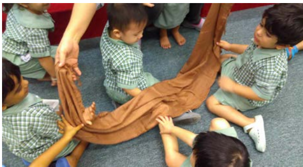
Touch and feel the texture!