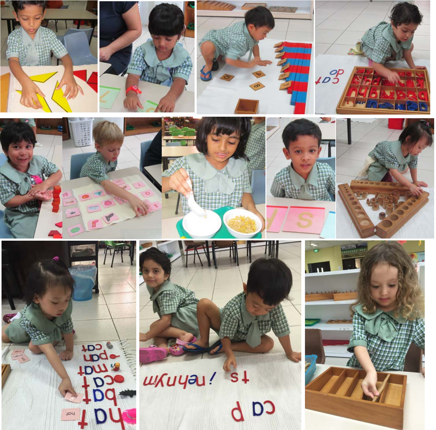
Reviewing individual letter sounds and forming words with letters.

This term, the kids are reviewing practical life and sensorial activities to further develop their fine motor skills, independence and concentration. They are also learning the numbers 1-10, recognizing individual sounds of the alphabets and building 3 letter words.